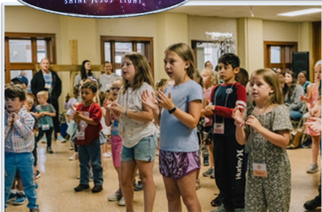
VBS Week included plenty of singing and dancing (above), and wrapped up with a Friday night block party (upper right) that included plenty of food and fun.