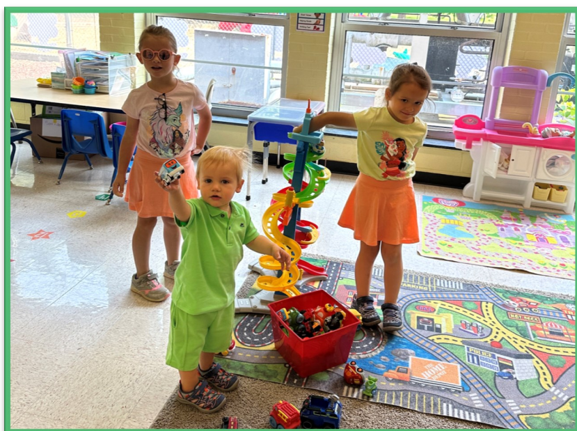
Summer playgroups give little ones a chance to meet new friends and acclimate to the preschool environment before school starts in the fall.