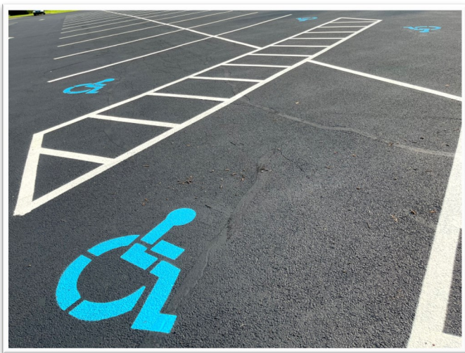
Our parking lot is smooth and clearly marked following summer repairs.

The slower pace of summer (with the bonus of supply chain and vendor availability issues mostly behind us) enabled the Property and Maintenance Commission to address several long-planned projects. In recent months, the following improvements were made: