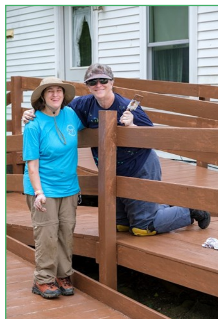
Participating in MATE shares God's love with our neighbors in need, and also lets team members bond with each other and develop new skills.