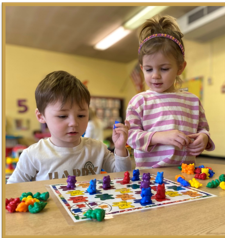
Making friends and learning through games are important parts of the CHPC Preschool experience.

In April , our classes will be busy preparing for egg hunts, celebrating spring, and enjoying the warm weather. We’ve been blessed with a generous donation of a sandbox, a bench, and a mini merry-go-round for our