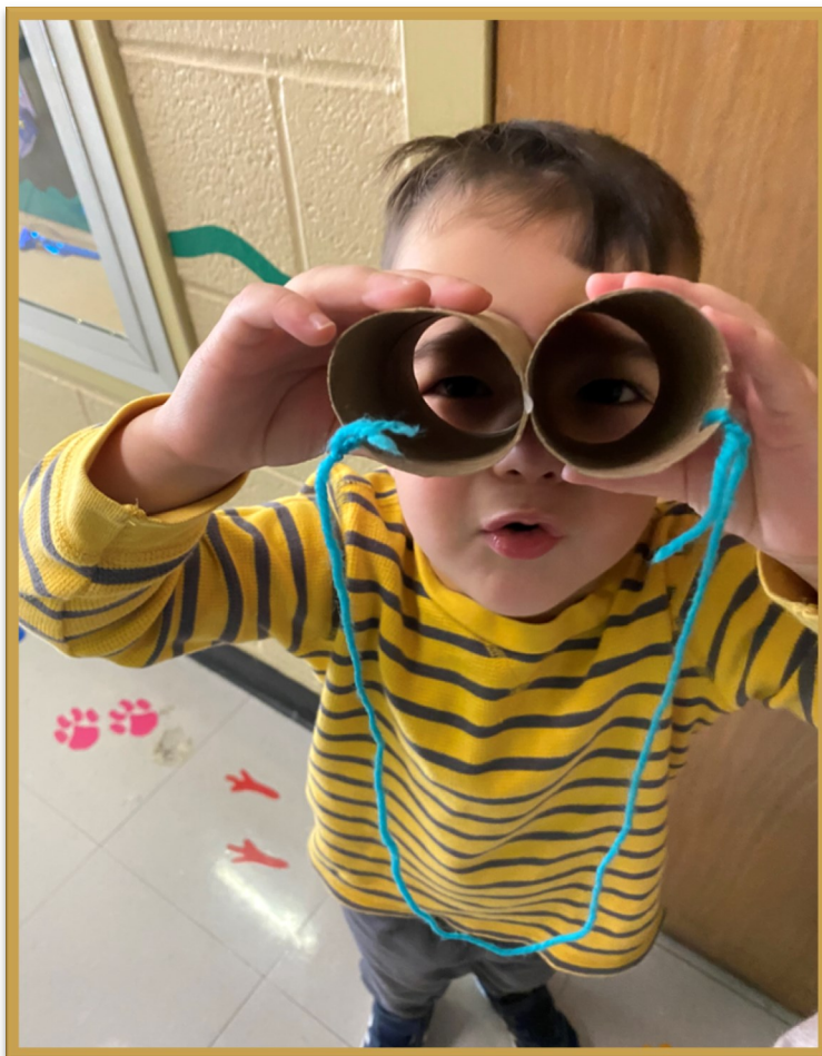
Where is that bear? Binoculars help a lot during January’s fun Bear Week hunt.

Read Across America Week will be held Monday, Feb. 27, through Friday, March 3. We will celebrate famous children’s authors and books